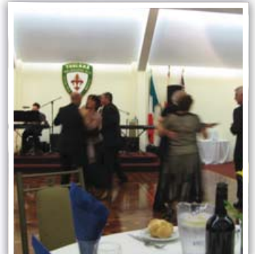
Plenty of dancing with the Toscana Social Club's One Man Band providing musical entertainment for the dinner.