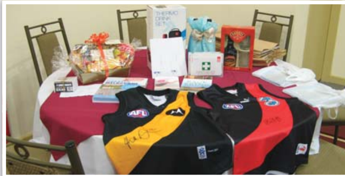
Our auction and raffle prizes helped raise $1,013 for club community projects. Former Richmond captain and AFL Hall of Fame player Dale Weightman was guest auctioneer.